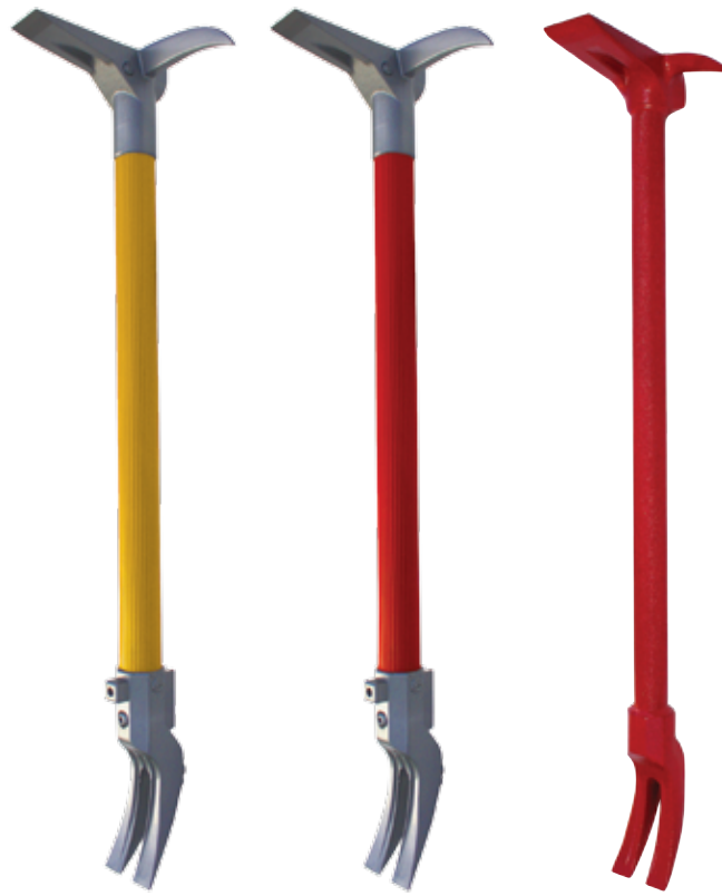
ZT43 HALLIGAN TOOL ZT43-36 shown